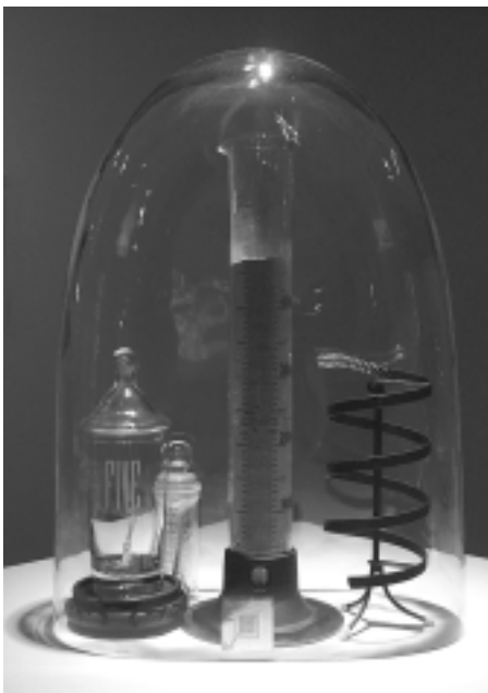
Crystal Palace (detail) (2001)