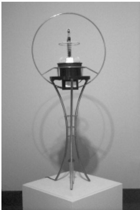
Bad vibe (2001)

the dissonant rhythms of 81 different speeds of 81 different radiometers. Popular knick-knacks descended from "real" science, radiometers never actually proved the theory for which they were invented (the construction of light as particles, not waves) but became useful elsewhere.